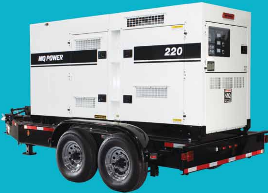
[ DCA220SSCU4i ]