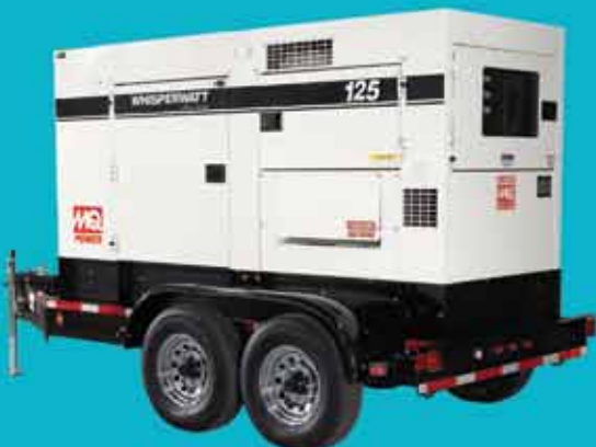
[ DCA125US ]