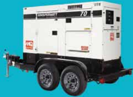
[ DCA70US ]