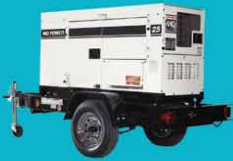
[ DCA25SS ]