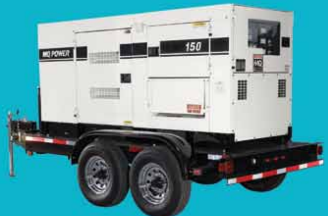
[ DCA150SSCU4i ]