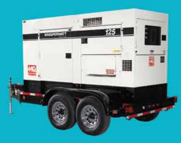
[ DCA125US ]