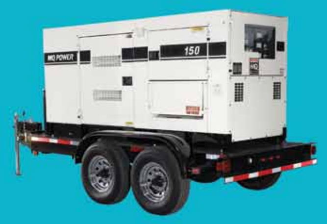
[ DCA150SSCU4i ]