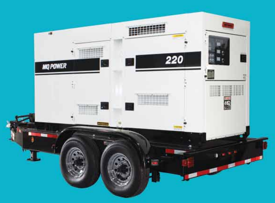
[ DCA220SSCU4i ]