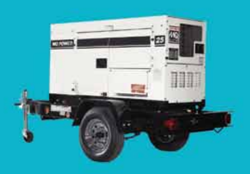
[ DCA25SS ]